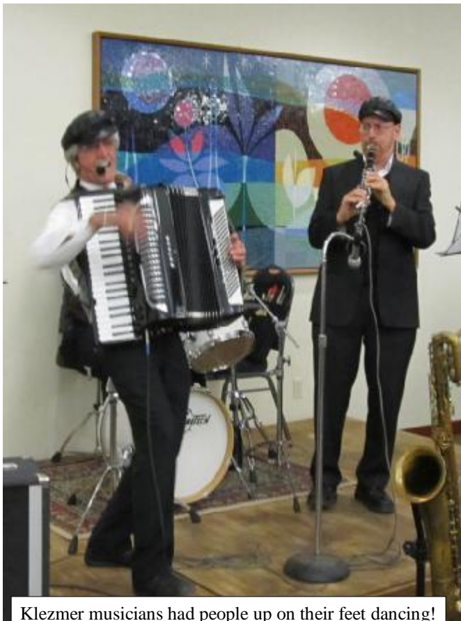
Klezmer musicians had people up on their feet dancing!