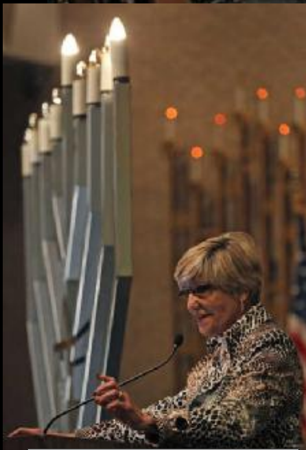
Fort Worth Mayor Betsy Price lights the grand Chanukah