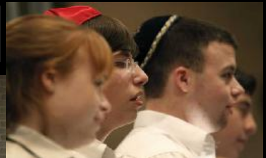
A close-up of our good-looking students leading in the Chanukah songs