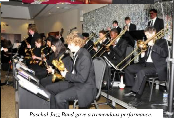
Paschal Jazz Band gave a tremendous performance.