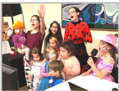
Karaoke: It's time to shine!