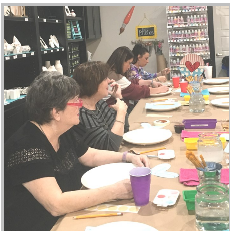
Donorpalooza Event—Let's Paint Pottery - The Art Barn Studio