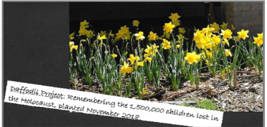
Daffodil Project: Remembering the 1,500,000 children lost in the Holocaust, planted November 2018