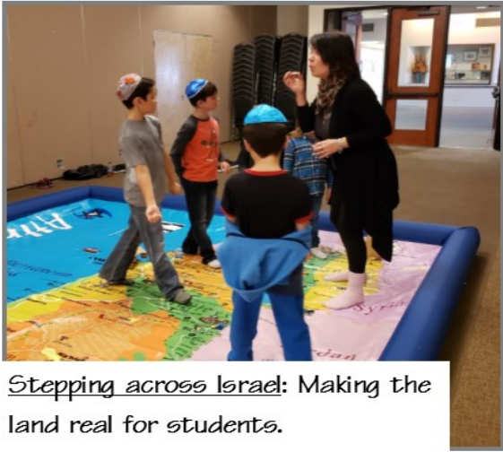
Stepping across Israel: Making the land real for students.