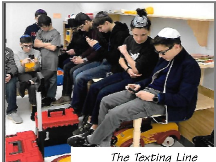
The Texting Line