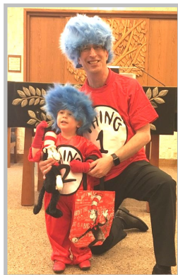
Thing 1 and Thing 2: Do you recognize them?