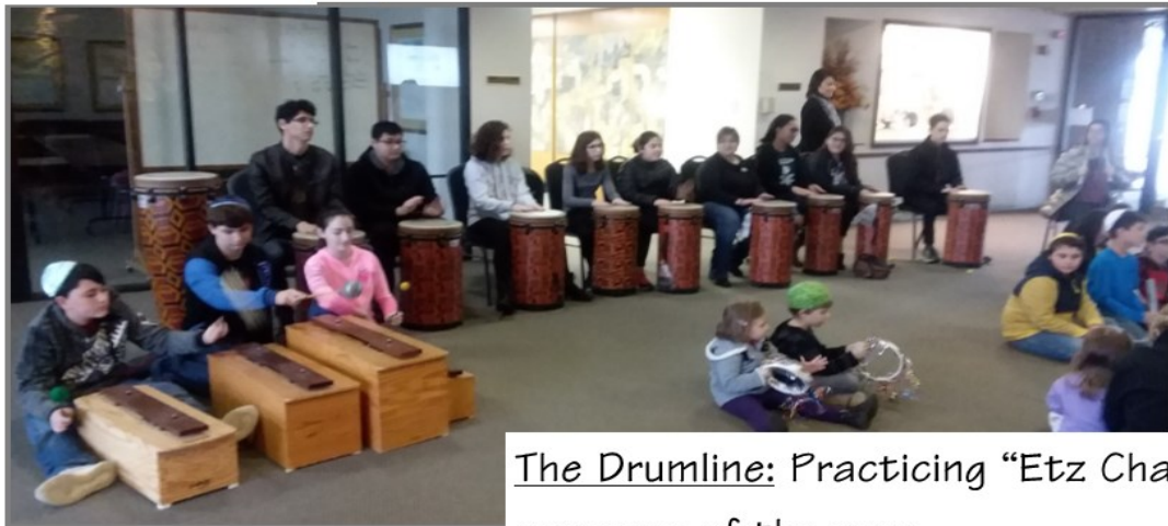
The Drumline: Practicing “Etz Chaim Hi,” our song of the year.