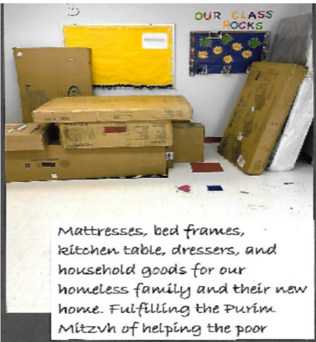
Mattresses, bed frames, kitchen table, dressers, and household goods for our homeless family and their new home. Fulfilling the Purim Mitzvah of helping the poor