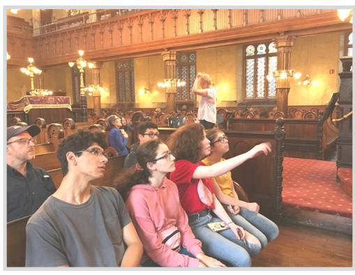
Eldridge Street Synagogue