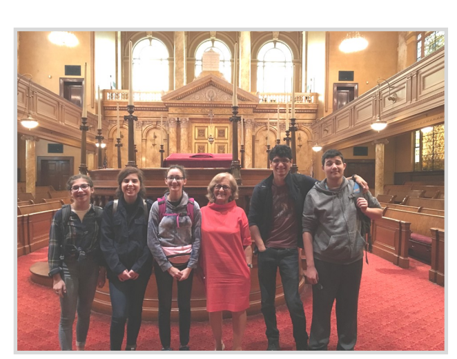
Shearith Israel Synagogue

Bringing God and the Community Closer Together A Conservative Synagogue affiliated with the United Synagogue of Conservative Judaism