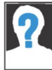
PRESENTING 2019 Jewish Person of the Year