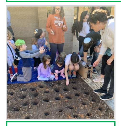
L&EC Students planting daffodil bulbs for The Daffodil Project