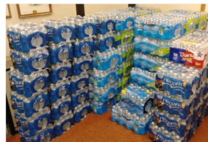
Pictured above: 2019 Water Drive Donations Collected

"They will neither hunger nor thirst, nor will the desert heat or the sun beat down on them. He who has compassion on them will guide them and lead them beside springs of water." (Isaiah 49:10)