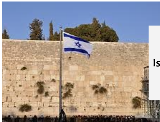
Israeli flag at the Western Wall.

Yom Ha'Atzmaut Israel Independence Day Thursday, April 15th