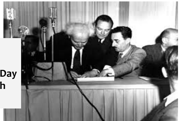
Ben-Gurion signing the Declaration of Independence.

Yom Ha'Atzmaut Israel Independence Day Thursday, April 15th