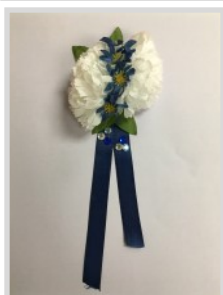
Mini-Mum (top) Boutonniere (below)