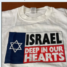
This T-shirt says it best!!